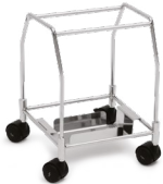
25 L XL Trolley