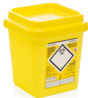
Clinisafe Plastic Clinical Waste Streams

Clinisafe is specifically designed to enable the safe disposal of non-sharps clinical waste and consists of containers from 3L to 60L. Clinisafe Clinical Waste Container range has been designed to hold anatomical and laboratory waste. A hermetic glue seal makes the container capable of containing bone, blood and other tissue fluids, whilst providing improved leak resistance.