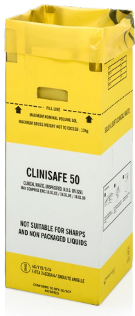
Clinisafe Cardboard Clinical Waste Streams

The container also contains an integral polythene liner minimizing the risk of exposure to the waste. These features and benefits make the range an environmentally-friendly and cost-effective alternative to plastic waste containers.